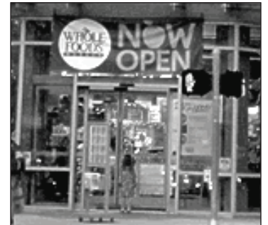
Whole Foods opens in Hollywood

Opened Tue. Jan. 12. Full service supermarket on NE 43rd and Sandy, parking on 44th. Deli and food stations. Some nice touches like stocking Laurelwood beer.