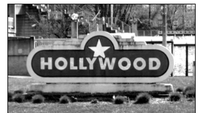
Hollywood sign at the Transit Center

Meetings held quarterly, in Jan, Apr, Jul, Oct (usually on the fourth Thursday of the month). For information call Central NE Neighbors at 503-823-3156 or email HNA at: info@hollywoodinportland.org