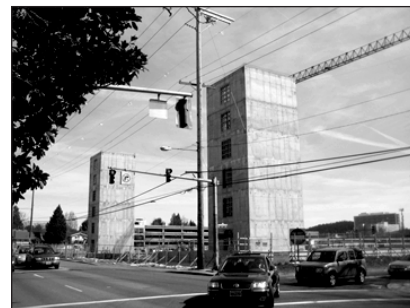
Providence building construction on Halsey in April

The foundation has been poured. The street alignment and traffic signal at 45th and Halsey are slated for completion in mid-summer. Completion of the whole project, known as the Halsey Business Center, is targeted for end of summer/early fall 2010.