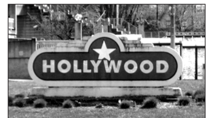
Hollywood sign at the Transit Center

Meetings held quarterly, in Jan, Apr, Jul, Oct (usually on the fourth Thursday of the month). For information call Central NE Neighbors at 503-823-3156 or email HNA at: info@hollywoodinportland.org