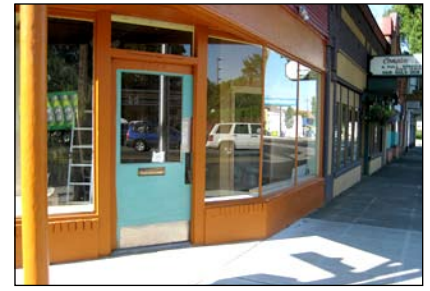
Recently closed Lungta Tibetan restaurant will become Nasca Peruvian cuisine

The new restaurant, Nasca, will serve traditional Peruvian cuisine.