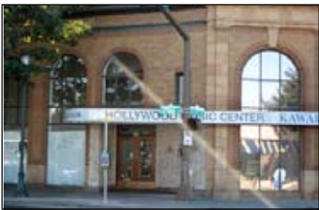
Hollywood Music Center's corner location with its iconic architecture is closed up.

It must have been tough to sell pianos in this economy.