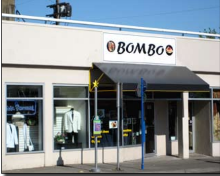
Bombo is open and serving food & drinks.

This small cafe is open in the previous Freedom Cup location across from the Hollywood Burger Bar on NE 42nd x Sandy. Pick up some snack food, like gyros and pastries, or a coffee or smoothie.