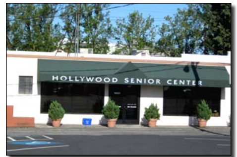
The Hollywood Senior Center seen from the back entrance.

23-24 August - Shakespeare-in-the-Parks Performing "The Two Gentlemen of Verona" @ Fernhill Park [3pm] Free