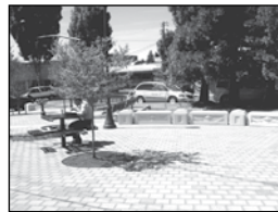
Right: The Plaza as it nears completion on June 30th.