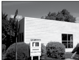
Above & below: Growing Seeds building for lease

Daddies Board Shop moved a little further away from the Hollywood to its new, larger location on Sandy x NE 72nd. www.daddiesboardshop.com