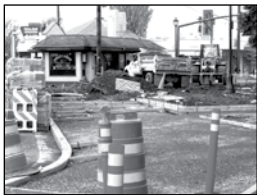
Left: Harold Kelly Plaza during construction in April

Harold Kelly Plaza (next to Hollywood Burger Bar on Sandy x 42nd)